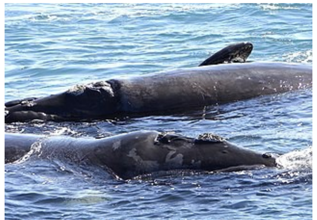
B.Navez, Southern Right Whale, via commons.wikimedia.org

On YouTube Dave Webber sings this shanty lustily at youtu.be/YgTve-TGMhw , but verse 5 precedes 4.