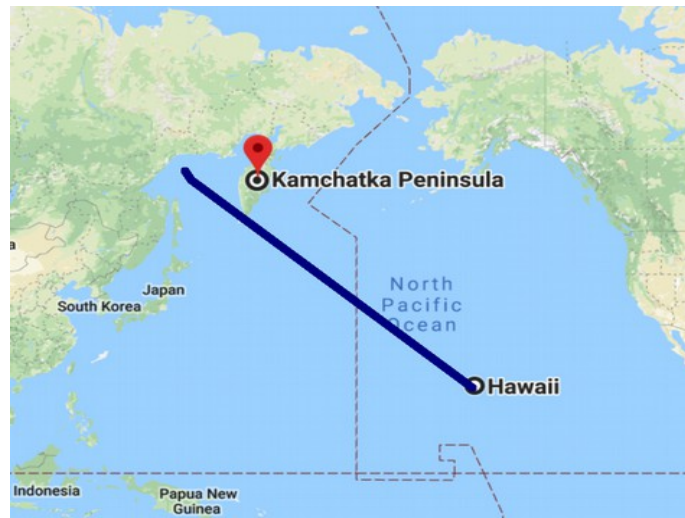
2,800 nautical miles (from Google Maps ).

From the Kamchatka Sea (Sea of Okhotsk) to Hawaii is about 3,220 miles or about 2,800 nautical miles.