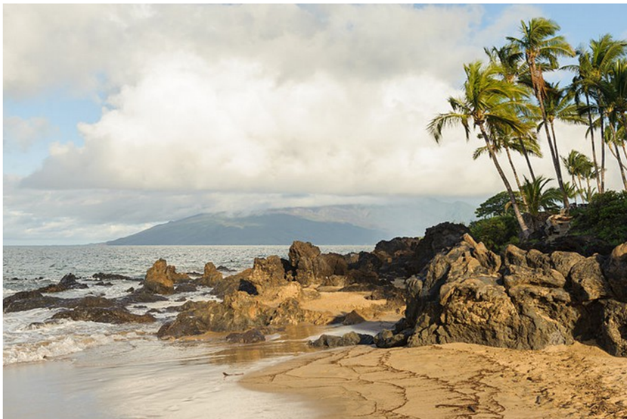
Maui, Hawaii Beach

Wahine - Hawaiian for "woman", hence a Hawaiian woman.