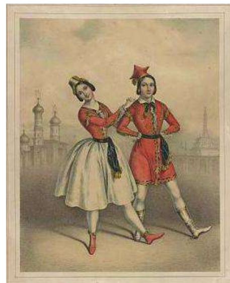
Perrot, Jules, 1810-1892, La polka. Madelle. Grisi & Monsr. 1840