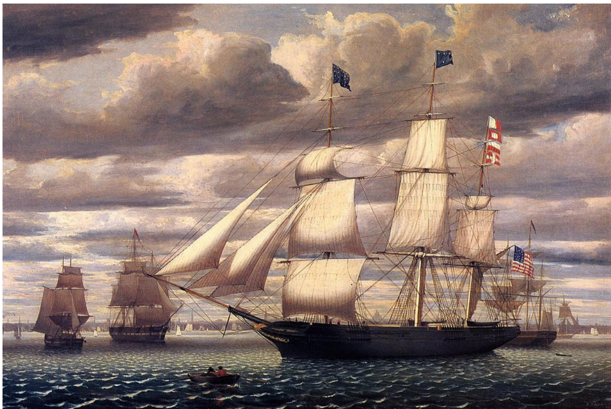
Fitz Hugh Lane (1804-1865): Clipper Ship "Southern Cross" Leaving Boston Harbor , 1851

Vallipo - Valparaiso, port in Chile (= Val-i-paraiso)