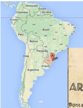
Left, map of South America showing the Brazilian province of Rio Grande do Sul as "RS" in pink.

The reference in some versions to "golden sand", whether taken literally or symbolically, apply to this southern Brazilian river and port, for both banks of the Brazilian Great River (it is a lagoon really) are heaped high with sand dunes, and in the past, gold was a commodity found in this district. ... Gold was [also] found in the Mexican Rio Grande district but [by then] this song was already well aired.