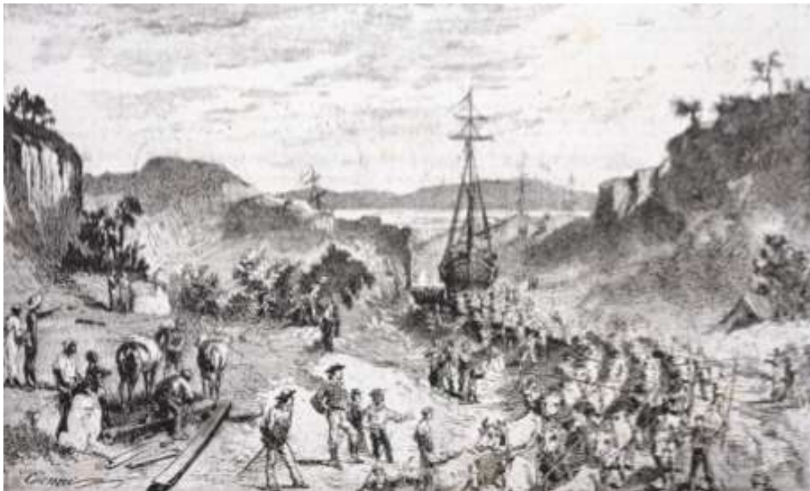
Garibaldi and his men carrying boats from Los Patos lagoon to Tramandahy lake during the War of Rio Grande do Sul. 19th century.

Compare it with the Fo'c'sle Singers' version at https://youtu.be/aVXaMgC1uz0