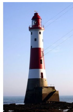
Beachy Head Lighthouse