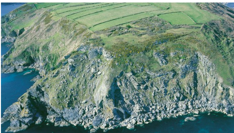
Jon Such , Bird's eye view of The Dodman from nationaltrust.org.uk

Sheets - ropes attached to the sails and leading aft