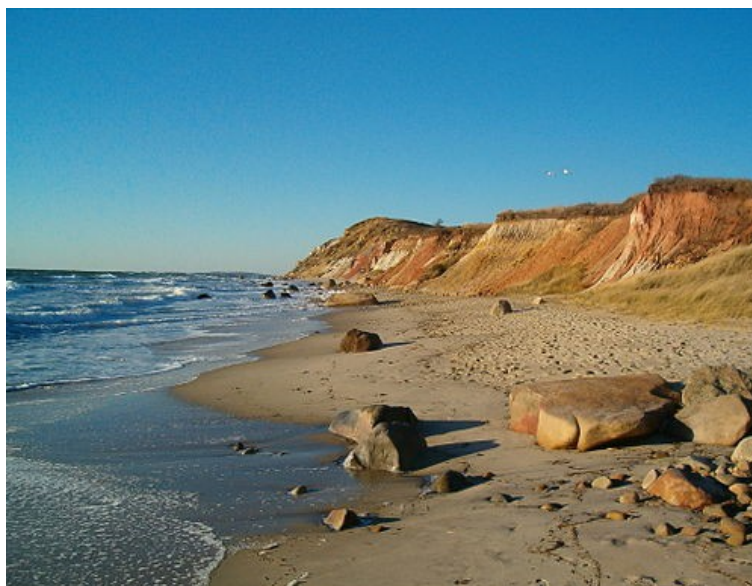
Gay Head Cliffs, MV

fly - when tacks and sheets "fly" they are no longer pulling on the sail; the sail spills the wind and the ship is no longer being driven by it.