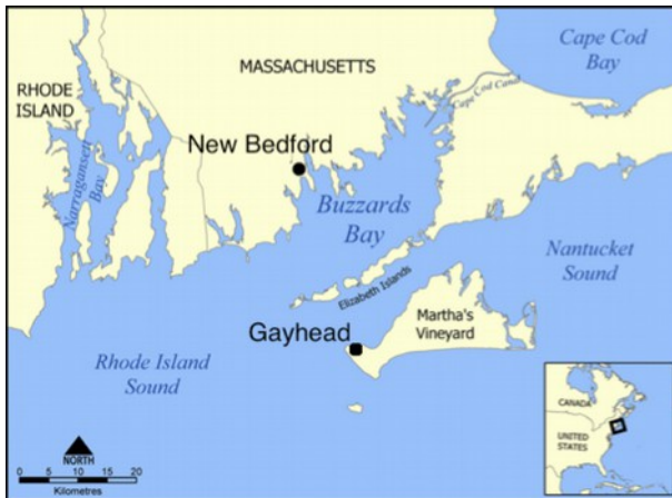
Map of Buzzards Bay off the coast of Massachusetts and Rhode Island, USA, showing Martha's Vineyard , Gayhead and New Bedford . By NormanEinstein at via Wikimedia Commons .

New Bedford was an important whaling station in the 19th century. Its whaling museum web site is very interesting..